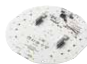
TALEXengine CLE Integrated